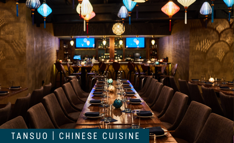
TANSUO | CHINESE CUISINE