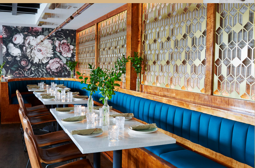
MORPH PRIVING DINING