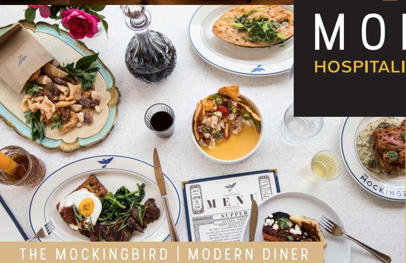
THE MOCKINGBIRD | MODERN DINER