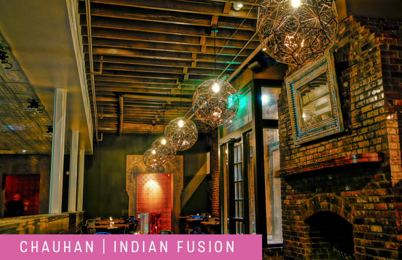
CHAUHAN | INDIAN FUSION